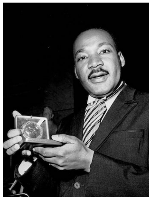
Dr. King with the Nobel Peace Prize

In 1968, Dr. King and the SCLC organized the "Poor People's Campaign" to address issues of economic justice. The campaign was preceded by King's final book, "Where Do We Go from Here: Chaos or Community?" Unfortunately, On April 4, 1968, Martin Luther King was killed by an assassin's bullet in Memphis, Tennessee, where he was slated to speak in support of black sanitation workers.