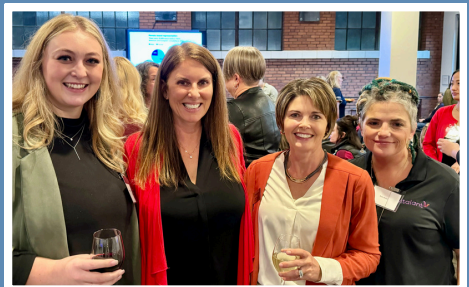
Amplifying Women's Voices with members of the Fall 2024 Gonzaga Certificate in Women's Leadership cohort.