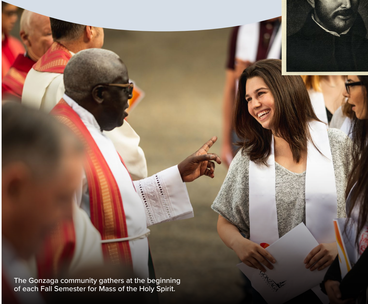
The Gonzaga community gathers at the beginning of each Fall Semester for Mass of the Holy Spirit.

The constant throughout 135 years has been Gonzaga's commitment to character and faith formation, and “ cura personalis ,” the Jesuit notion of care for the individual. These guiding themes have fostered a sense of community among students and alumni alike. Today, that experience of deep community continues to be a hallmark of the Gonzaga worldwide network.