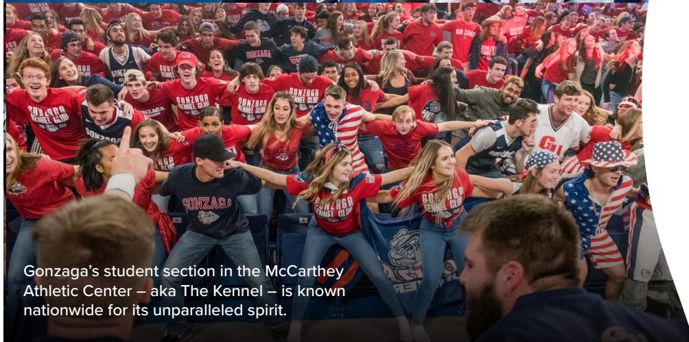
Gonzaga's student section in the McCarthy Athletic Center – aka The Kennel – is known nationwide for its unparalleled spirit.