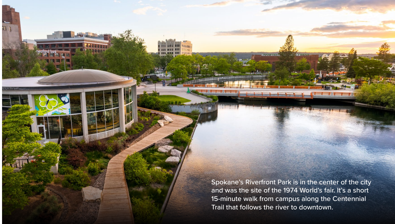
Spokane's Riverfront Park is in the center of the city and was the site of the 1974 World's fair. It's a short 15-minute walk from campus along the Centennial Trail that follows the river to downtown.

Fame: Spokane was the childhood home of Bing Crosby, a Gonzaga alum. A downtown theater is named for him, and Gonzaga boasts the largest private collection of Crosby memorabilia.