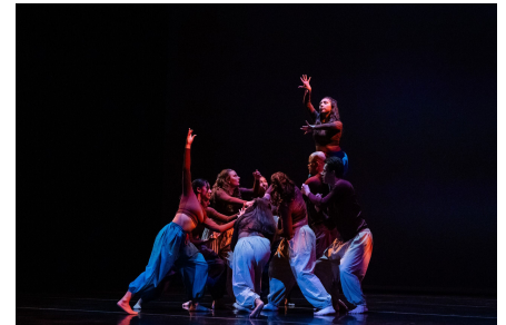
Essence of Four