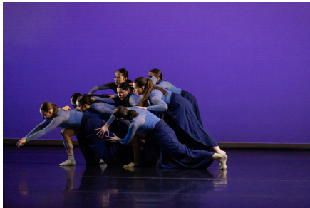
A Crossing Place