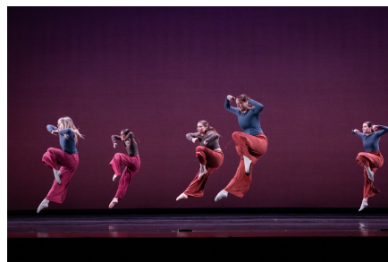
Let Me Tell You A Story