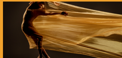
Alonzo King LINES