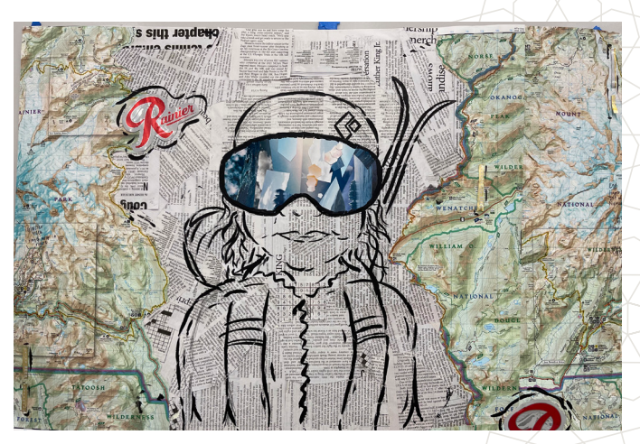
Student Art from New "Art Fusion" Course

during AY 2022-23, with two of the exhibitions, Home: Imagining the Irrevocable (February 2022) and No More Stolen Sisters (March 2022). specifically focused on artists from marginalized communities. No More Stolen Sisters, guest curated by local photographer/videographer Jeff Ferguson. was especially conceived as a social justice action intended to bring greater community and Gonzaga-student awareness around the issue of Missing and Murdered Indigenous Women (MMIW). Well over 200 people attended the exhibit during its opening receptions on March 5 and 6.