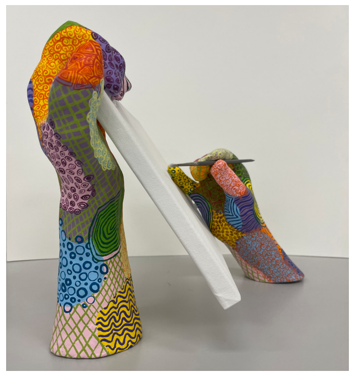
Student Art from New "Art Fusion" Course

Art faculty and staff supported and/or coordinated seven exhibitions at the GUUAC