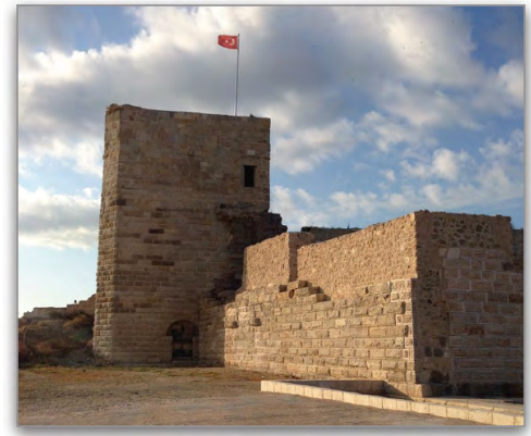
The kale , or castle, of Sinop

Sinop, a lovely town of ca. 35,000 people, our students will also have an opportunity to meet Turks and experience modern life in the dynamic country of Turkey. A blog will be created for those who wish to follow the events of 2016 while we are in the field, and of course you can follow us on Facebook, at the Sinop Kale Excavation page, to learn more about the latest developments.