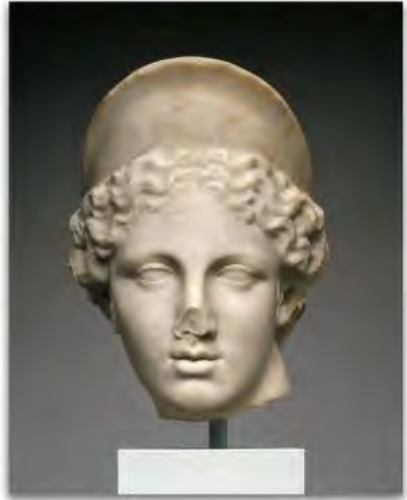
An example of the sort of amazing art coming to Gonzaga's Jundt Art Museum this Fall as part of this exhibit.