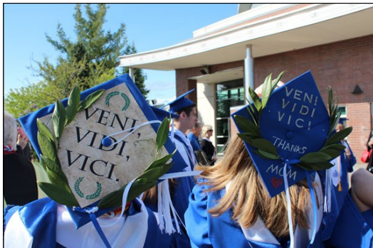
Graduation Time. And they Conquered.