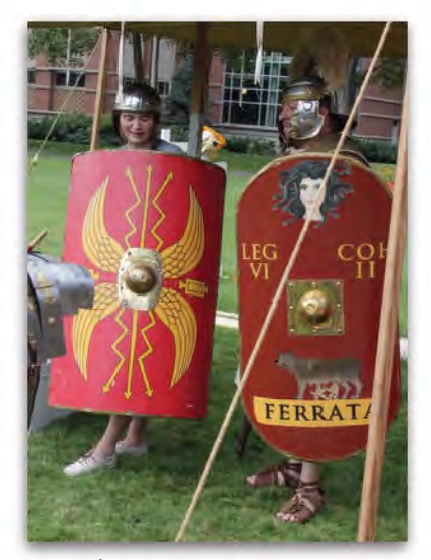
A Classics major arms up.