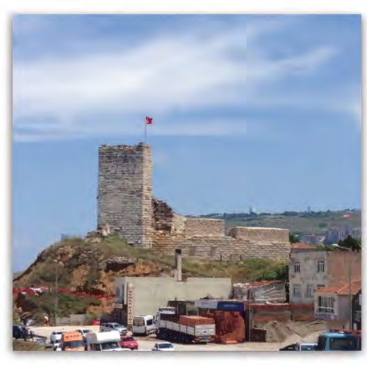
The kale, or citadel, of Sinop, Turkey.

It's never to early to start planning, though, so we are putting out the call for students interested in joining the excavation team for our 2018 field season. The excavation is located in a small town, Sinop (ancient Sinope), on the Turkish coast of the Black Sea. We offer a 5-week, 6-credit field school with two courses in history: "History through Archaeology" (HIST 390.1/CLAS 410), in which you learn field method and practice at the excavation, and "Archaeology and History of the Black Sea" (HIST 390.2), in which you learn the context of our finds and the fascinating cultural history of the Black Sea region.