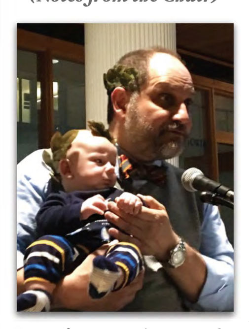
Sign of a growing department? The 2016 Homerathon had its