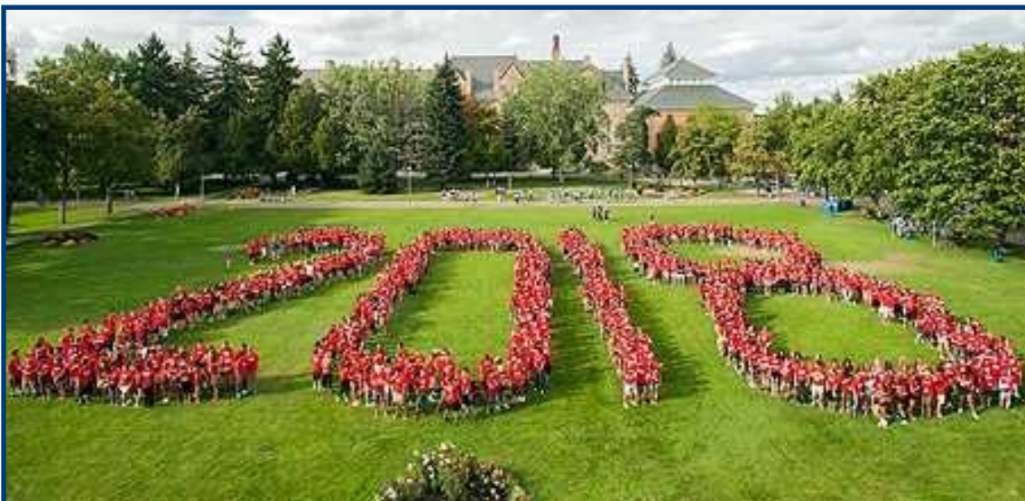
The Gonzaga Class of 2018 united on The Quad

Stories and books are mirrors into the soul of a culture. We would not be whole without them, as Milton knew: For books are not absolutely dead things, but do contain a potency of life in them...they do preserve as in a vial the purest efficacy and extraction of that living intellect that bred them. But language is more than written words—it is any way we communicate and it is what inspires passion, discussion, thought, and action in our society. Virginia Woolf, Lin-Manuel Miranda, Maya Angelou, and Elie Wiesel all changed the world, and they only used their words to do it.