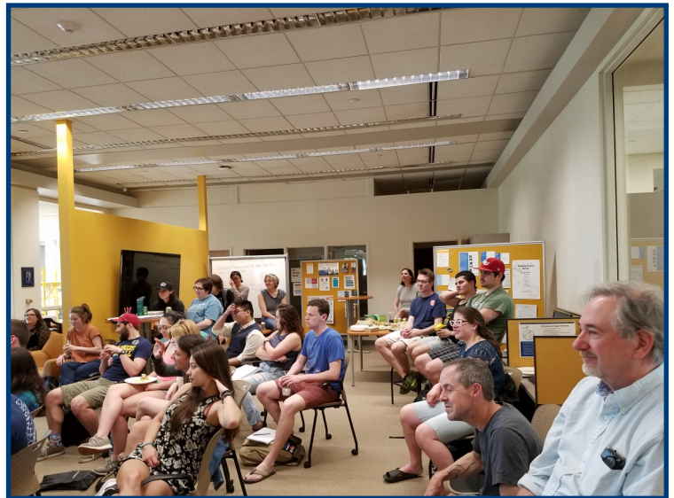
Captivated listeners in the GU Writing Center, listening to guest writer Hanif Abdurraqib

The close attention to language seems to me as important an endeavor as any we can undertake. It borders on cliché to say humans are the language (or story) making animals, but it is an evolutionary “miracle.” Taken further: we are, as individuals, as subjects, constituted by language: it is in a large system of a given language that we identify our own idea of who we are, what we feel, of what is right and what is wrong. And through that language (already socially given), we are able to negotiate and renegotiate all of those notions. The great 20th century philosopher Ludwig Wittgenstein leaves us a pair of famous axioms that have moved and influenced me throughout my adult life: first, “The limits of my language mean the limits of my world”; and second, “what we cannot speak of we must pass over in silence.”