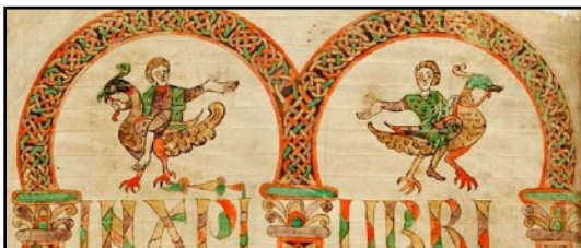
Merovingian illumination, early 8th century