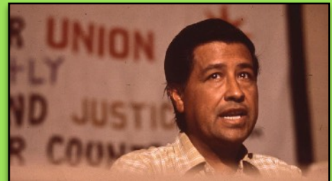
Cesar Chavez, 1972

National Historic Landmark. Located in San Jose, California, the former chapel building is closely associated with the life and work of labor leader and civil rights advocate Cesar Chavez.