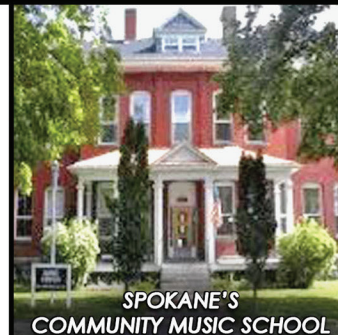
SPOKANE'S COMMUNITY MUSIC SCHOOL

CELLO CLARINET FIDDLE FLUTE GUITAR MANDOLIN PERCUSSION PIANO PICCOLO SAXOPHONE TROMBONE TRUMPET UKULELE VIOLA VIOLIN VOICE SING, SAY, DANCE & PLAY WORKSHOPS