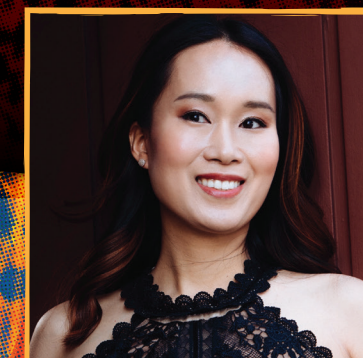
Shuying Li composer