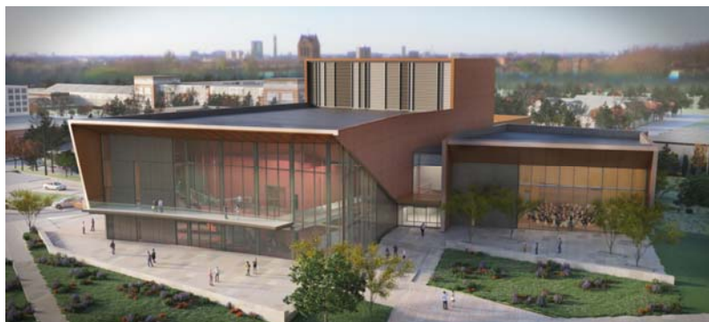
June 2017 PAC Rendering