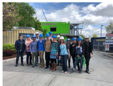
Music & Theatre & Dance Tour

For a listing of all Music Department events and academic program info please visit our website