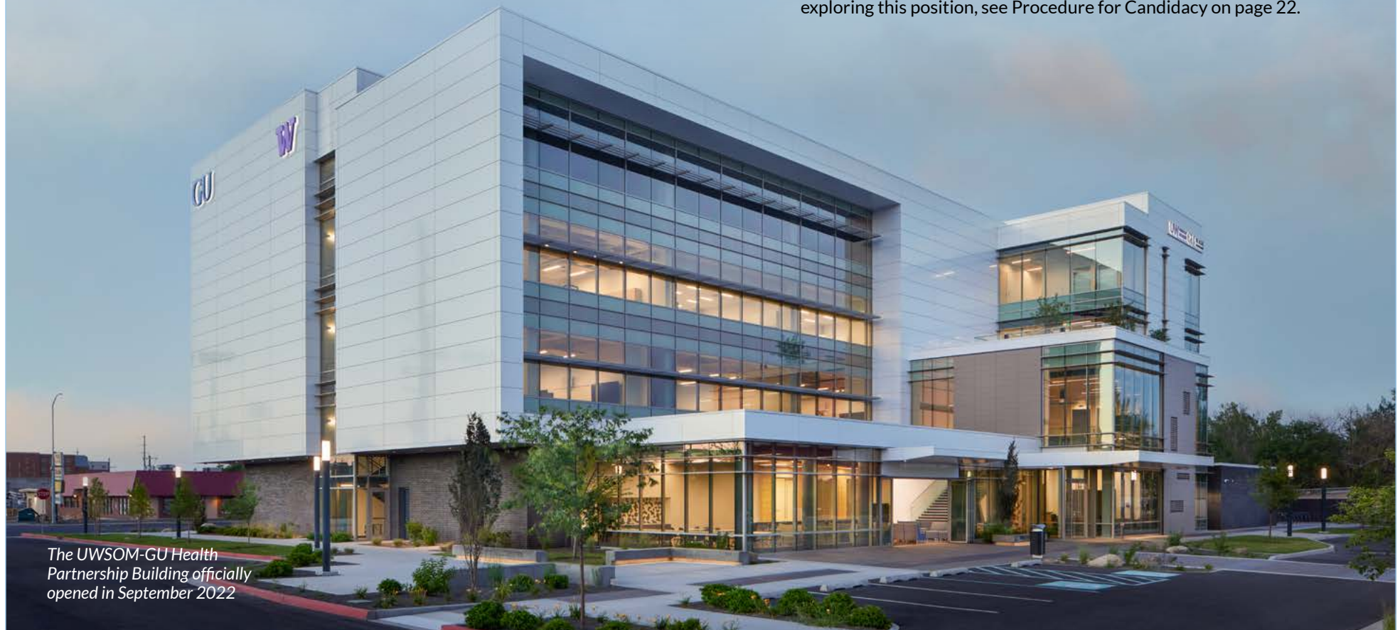
The UWSOM-GU Health Partnership Building officially opened in September 2022

To submit a nomination, apply, or express confidential interest in exploring this position, see Procedure for Candidacy on page 22.