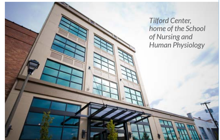
Tilford Center, home of the School of Nursing and Human Physiology