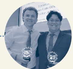
Late April – Senior Design Expo, final presentation, and awards banquet

The program concludes with the Design Expo , a showcase event open to the public where teams present their final results, including prototypes, posters, and formal presentations, to sponsors, advisors, and DAB members.