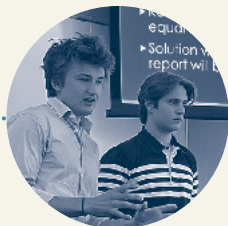
Late October – Students present initial research findings.

An industry mentor from our Design Advisory Board (DAB) supports each team with professional insights and practical advice. Our DAB is a network of over 50 professionals who generously volunteer their time and expertise. They provide mentorship, review student work, and help ensure that our program reflects the evolving standards and practices of the engineering and technology fields.