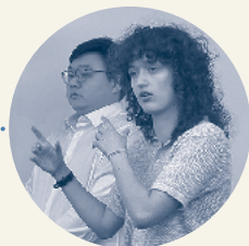
Early December – Students present design preparation