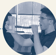
February – Students present design progress