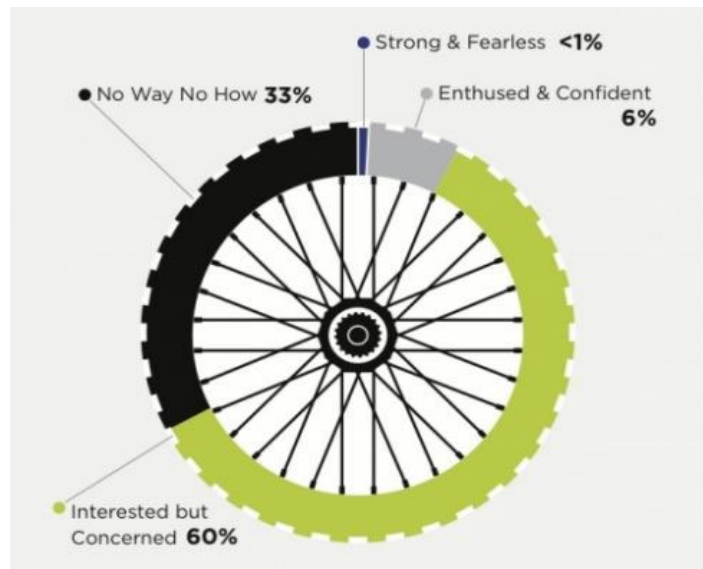
Figure 4. Types of transportation cyclists determined by the City of Portland.

perceived unsafe circumstances. The idea that walking around one's community is unsafe is a huge barrier for people who would otherwise be interested in using alternative modes of transportation. Figure 4 shows research results by the City of Portland. The four categories represent the circumstances in which people are willing to ride a bicycle. Sixty percent are interested but concerned, citing safety as a barrier to regular riding (Spokane Bicycle Master Plan, 2017). Having a connected bike network, as opposed to bike lanes that disappear after a few blocks, would provide people with the option to leave their car in the driveway for a sizable number of their outings. The Netherlands is a mostly flat country, but some southern cities, like Maastricht, have more varied terrain. The hills don't stop people from cycling in these Dutch cities. Although the hilly terrain of Spokane adds another challenge to regular bicycle ridership, it is not a deal-breaking obstacle.