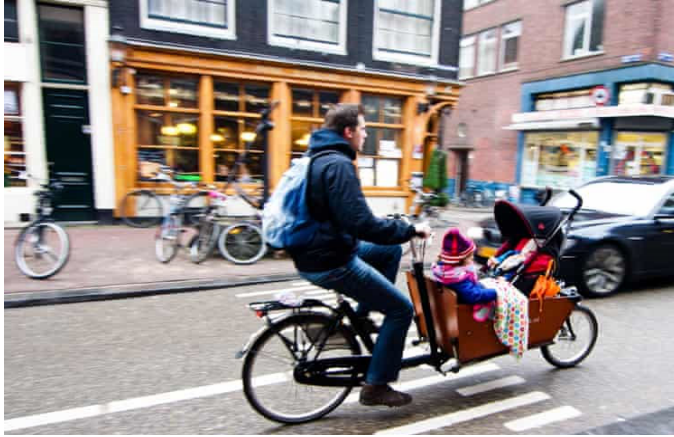
Figure 3. Cyclist with a child carrier on the roads in Amsterdam.

extremely high, as is the number of trips that combine cycling and walking with public transportation. The features that make this possible are numerous, including a totally different mindset towards cars, pedestrians and bicyclists than the US. In the Netherlands, active transportation is both safe and convenient for people to use. Reducing the points of friction for something to happen is the