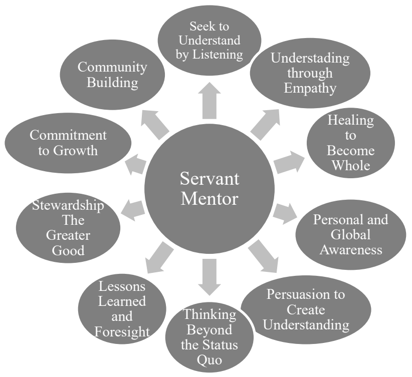
Figure 2 . Represents the characteristics of a mentor displaying servant-leadership.

foresight, stewardship, commitment to growth, and community building. Depicted in Figure 2 are the themes as they relate to mentoring and the characteristics to follow to become a servant mentor.