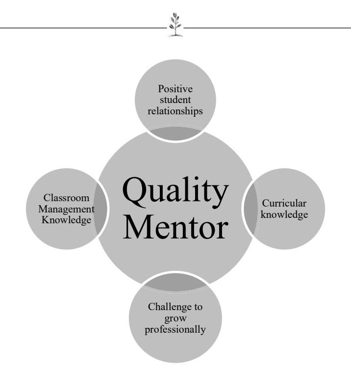
Figure 1 . Representation of the topics emphasized through mentoring.

What, if any, of the ten characteristics of servant-leadership did mentors of quality K-12 teachers utilize during the mentoring process?