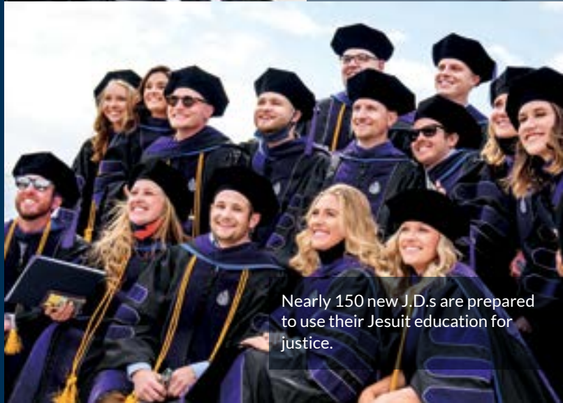
Nearly 150 new J.D.s are prepared to use their Jesuit education for justice.