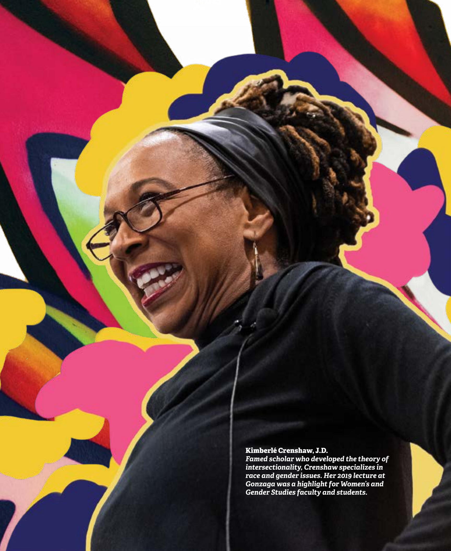
Kimberlé Crenshaw, J.D. Famed scholar who developed the theory of intersectionality, Crenshaw specializes in race and gender issues. Her 2019 lecture at Gonzaga was a highlight for Women's and Gender Studies faculty and students.