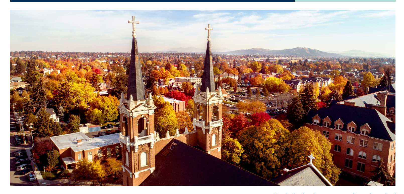
Now is the time for our community, and people of the world, to come together and begin the healing process through our multiple issues.