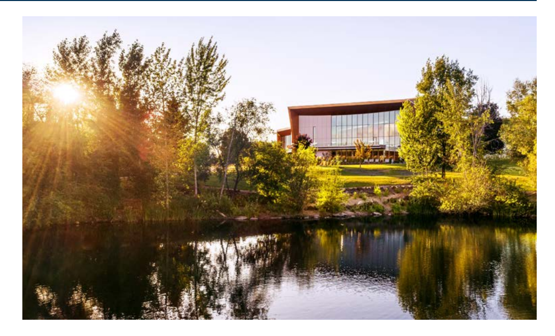
The performing arts will take a new direction this fall with performances more-than-likely online and streamed.

Seems like every story starts out, "Because of the pandemic ... "Gonzaga's visual and performing arts are no different. Significant adjustments have been made to fall plans and schedules to give artists new ways of sharing their skills.