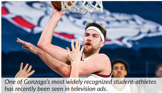
One of Gonzaga's most widely recognized student-athletes has recently been seen in television ads.