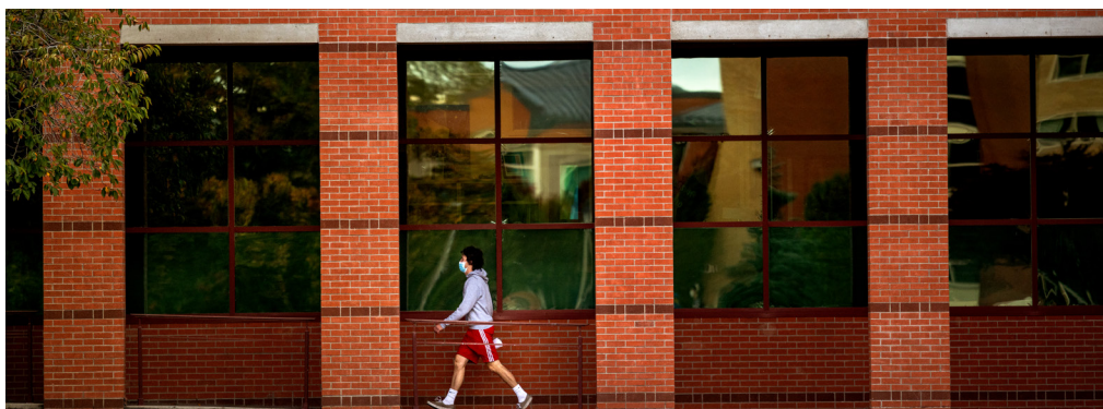
Students may click on Gonzaga's Wellness Toolbox for a plethora mental wellbeing support, which has continued to expand during the pandemic.