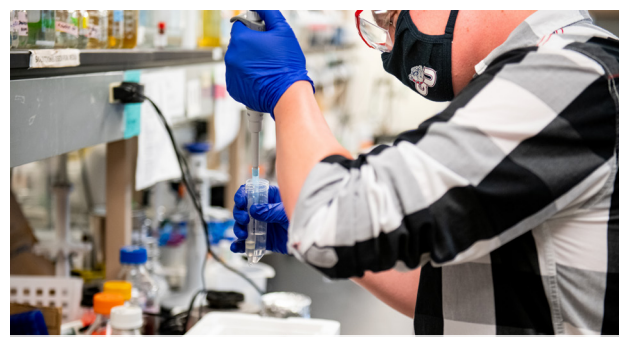
Undergraduate research opportunities to be bolstered.

Bracke sees staffing and process efficiencies within the institute by better coordinating