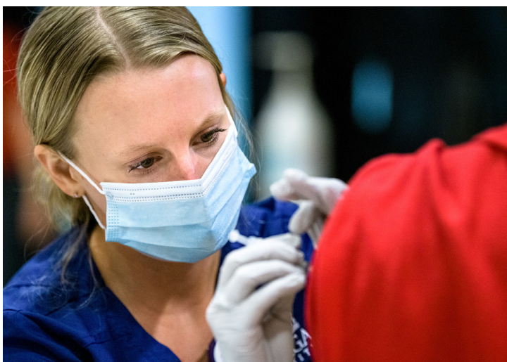
GU nursing students making an impact on the community even before they graduate.