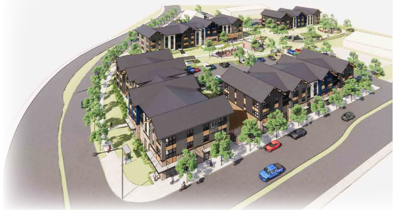
Gonzaga Family Haven is under construction on the corner of Hamilton and North Foothills Drive.

For more information, click www.cceasternwa.org/gonzaga-family-haven