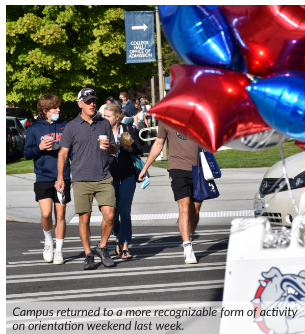
Campus returned to a more recognizable form of activity on orientation weekend last week.