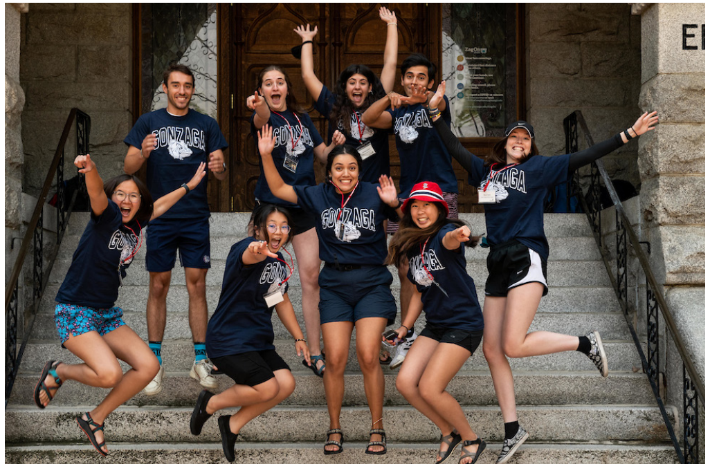
Gonzaga students immersed themselves in Northeast Spokane this summer to support youth in a variety of ways.

"As perfect as this may sound, the fellowship also opened my eyes to some worrisome issues affecting not only our Spokane community, but the whole country. I realized how much impact the growing inequality gap in America is having on the prospects of our youth. While some of us see college as another mundane and obvious step in our lives, many kids in our community see it as a fantastic dream. Inequality continues to affect many generations. While the rich keep getting richer, the lower classes keep experiencing a reduction in their