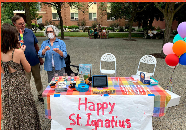
An ice cream social for the Feast of St. Ignatius, with Ignatius-themed raffle items, kicked off the yearlong celebration.

Gonzaga joins with the area’s Jesuit apostolates – Gonzaga Prep, St. Aloysius