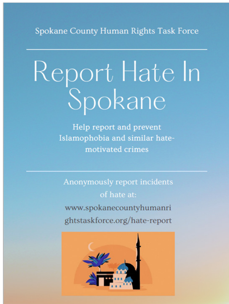
Poster created by students.