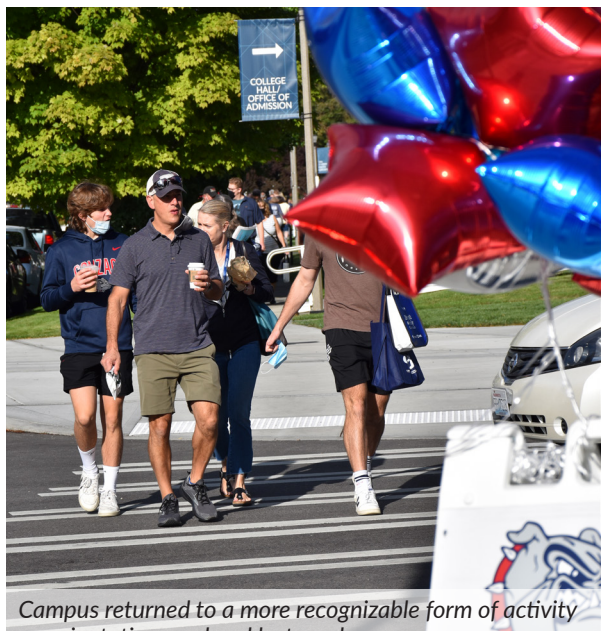
on orientation weekend last week.