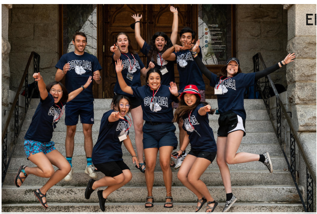
Gonzaga students immersed themselves in Northeast Spokane this summer to support youth in a variety of ways.

"As perfect as this may sound, the fellowship also opened my eyes to some worrisome issues affecting not only our Spokane community, but the whole country. I realized how much impact the growing inequality gap in America is having on the prospects of our youth. While some of us see college as another mundane and obvious step in our lives, many kids in our community see it as a fantastic dream. Inequality continues to affect many generations. While the rich keep getting richer, the lower classes keep experiencing a reduction in their