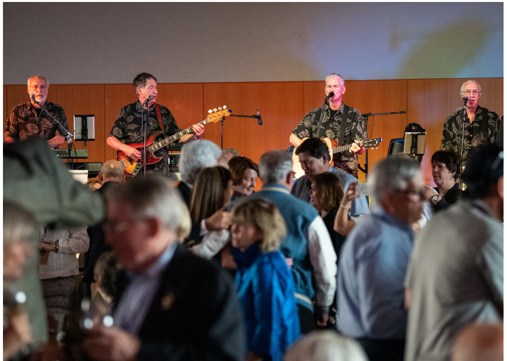
Zagapalooza all-class reunion was last held in 2015, and only once before that.

The evening culminates with an all-class Bulldog Blast at the Spokane Convention Center, 6-9 p.m. with live music, dancing, heavy hors d'oeuvres and beverages. The Gonzaga cheer squad and pep band will be there to rally the troops. Suspicion is that alumni will continue the festivities well into the night at other area locations.