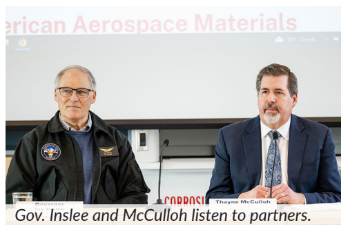
Gov. Inslee and McCulloh listen to partners.

https://www.gonzaga.edu/news-events/stories/2024/2/13/gu-led-tech-hub-discusses-progress-with-jay-inslee