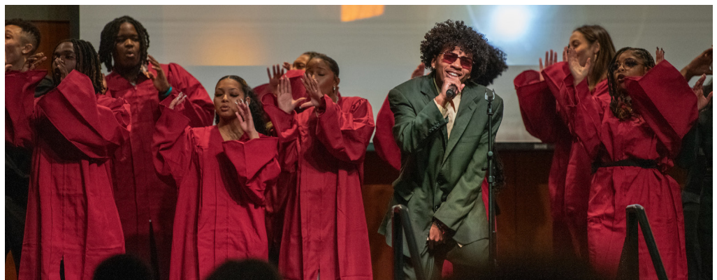
Two of GU's 13 culture clubs presented fabulous dinners, exhibitions and programs in February events in the COG, Tet Lunar New Year and Black Student Union's "A Cultural Explosion."

featured ethnic dinners and programming in the COG.