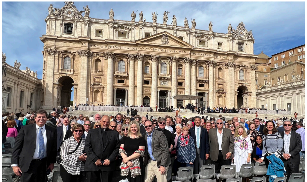
Gonzaga Trustees and staff attended a General Audience with His Holiness Pope Francis.