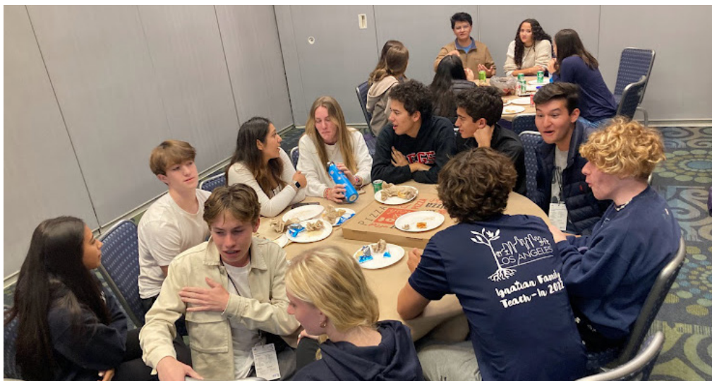
Students from across the U.S. working together to advocate for others at the October Ignatian Teach-In for Justice in Washington, D.C.