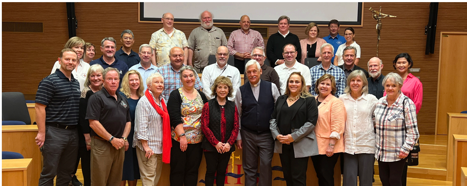
Trustees and GU staff met in Rome with Father General Arturo Sosa, S.J.

Sometimes the smallest, simplest things can have the most impact on a person. Even something as small as a single brick in a city of nearly three million people.