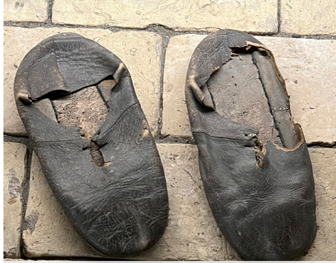
Shoes that Saint Ignatius wore while establishing the Society of Jesus.

"People welcomed us with open and enthusiastic arms – which is the experience I have always had, especially of Jesuits who have always been welcoming of me, as lay companion in the work."