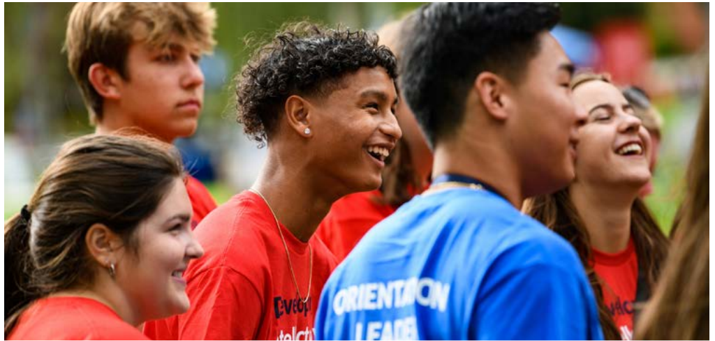
GU piloted a successful summer session of New Student Orientation last July. Plans to pilot a summer orientation for all students in 2023 are moving forward.

The associate provost says the University is looking to increase transfer initiatives, including a potential partnership with the Community Colleges of Spokane; pursue possibilities with colleagues in Student Affairs on Opportunity Northeast projects; and explore partnerships which could include Spokane Public Schools, corporate partnerships and other organizations.