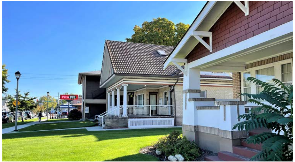
Site for proposed sophomore housing is between Cincinnati and Hamilton on the south side of Sharp, immediately west of Pita Pit.