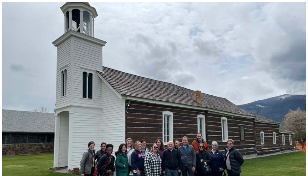
As we celebrate Native American Heritage Month, Spirit looks back on a Gonzaga mission immersion trip in May to learn more about the relationships between Jesuit missionaries and Native peoples.

Participants listened to Native community members share their own histories, then