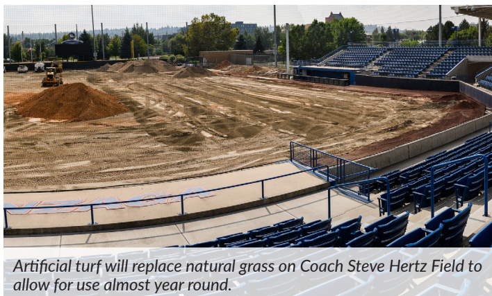
Artificial turf will replace natural grass on Coach Steve Hertz Field to allow for use almost year round.