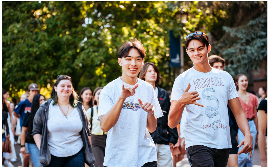
Gonzaga welcomed nearly 1,200 first-year students with bright smiles to campus in August.

He continued: “Our students gain competence and confidence and the capacity with skill and depth of understanding to engage in the tasks that will next lie in front of them. This is the work you do. Our labor of education is within and outside the classroom. In our community, our students are learning in many ways, perhaps most acutely through observation. How we act, react, treat one another, treat them. They learn about systems and decision-making through the way we provide services. We are a complex multidimensional living laboratory for adulthood.”