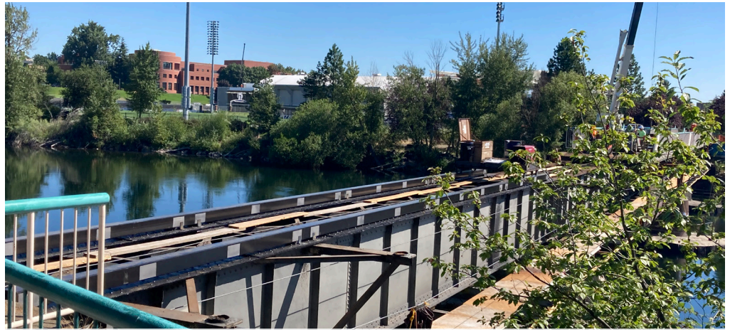
The old deck and railroad ties underneath the Kardong Bridge have been removed, and will be replaced with a smoother, long-lasting concrete surface.

Over the next couple of months, the new bridge decking will be placed and the new electrical system will be installed. "We look to have the new deck installed and all paving work completed prior to freezing conditions and will continue work into the colder months to complete the railings and lighting," Hamad says.