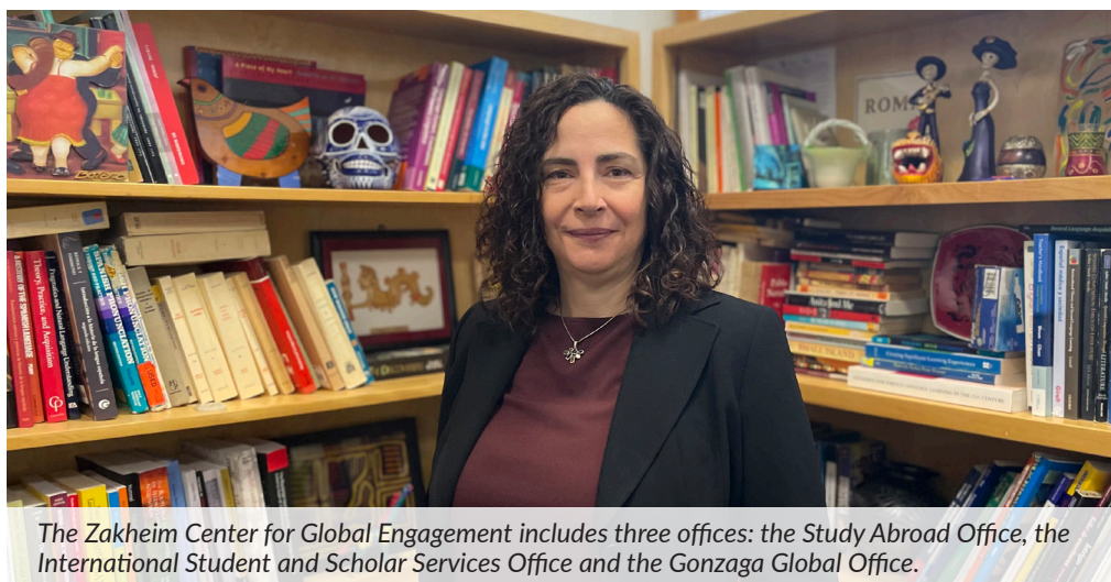
The Zakheim Center for Global Engagement includes three offices: the Study Abroad Office, the International Student and Scholar Services Office and the Gonzaga Global Office.

Some of the well-known opportunities are the study abroad programs and the international student events that provide ways to engage with students from diverse backgrounds. We