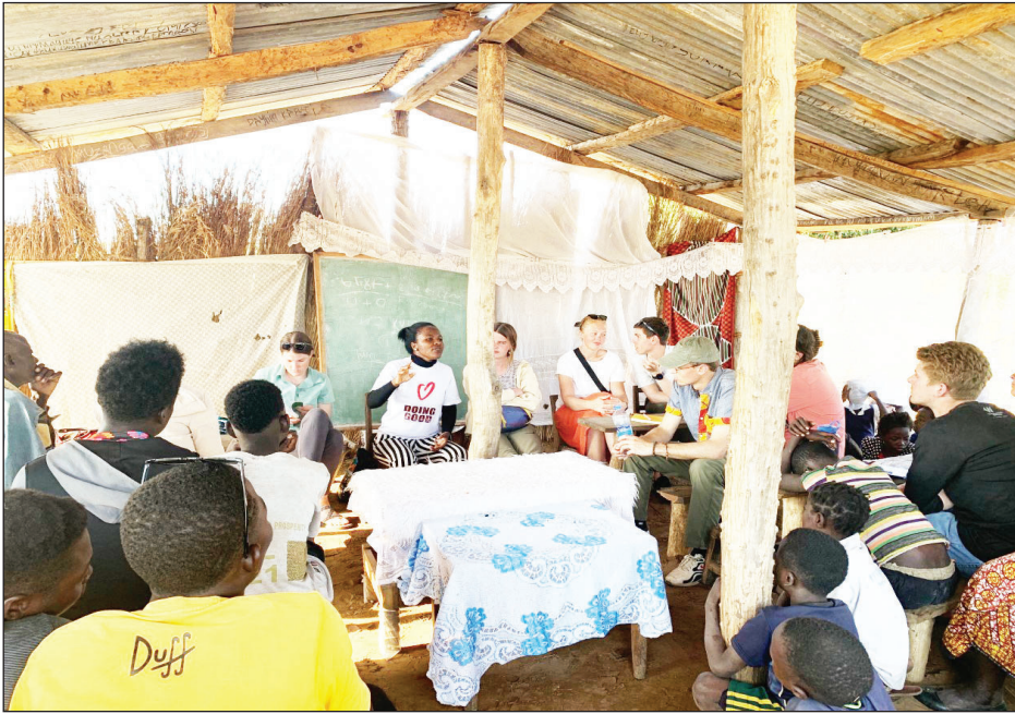
Students have the opportunity to travel to Zambezi, Zambia for study abroad.