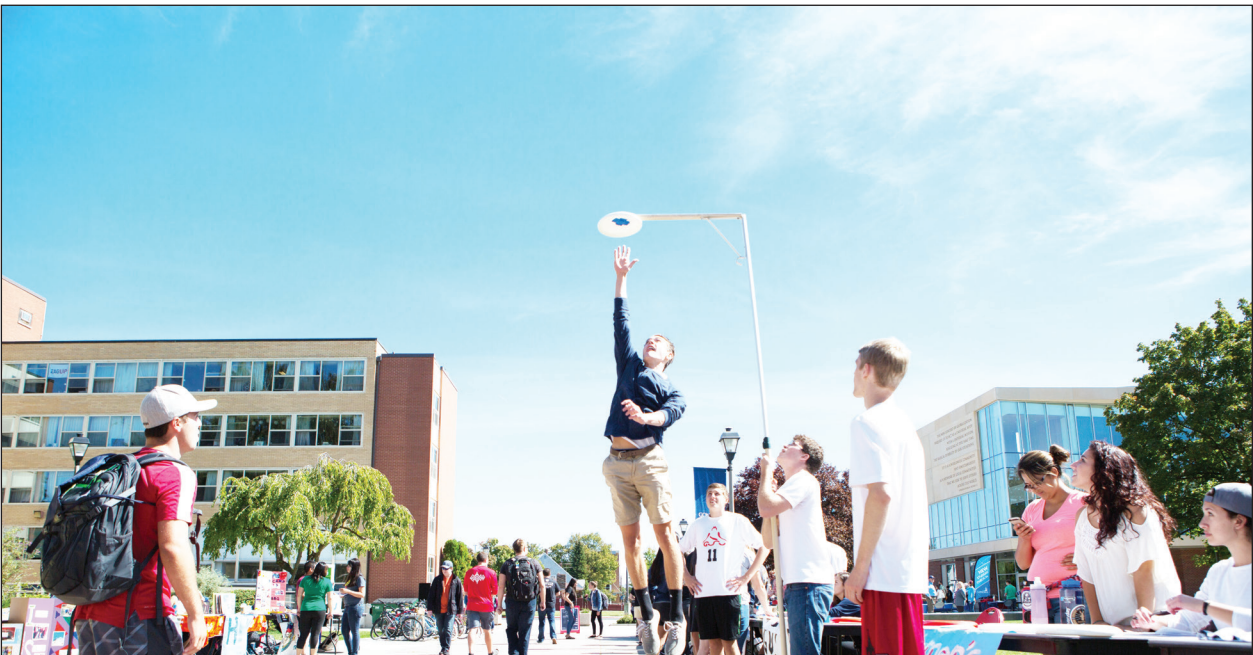
Club representatives gathered along Bulldog Alley for the club fair in the fall.